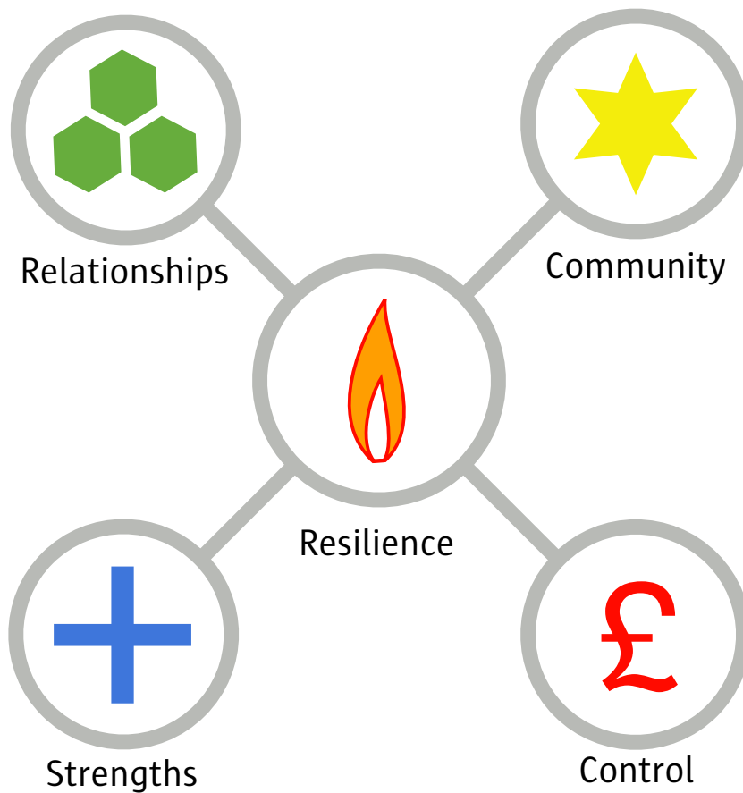
Figure 1. Real Wealth

support and nurture the disabled child. [See Figure 1 and Pippa Murray's paper A Fair Start for a full discussion of this concept.]